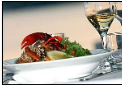
Riverside Masterplan East Perth Redevelopment Authority

The Activity Centres Review study provides analysis of transport-oriented development activity centres from Maylands to Guildford, determining existing and future functions and characteristics. It contains examination of the hard land uses of each centre, including residential and commercial population and demographics, and identifies potential opportunities for redevelopment and growth in residential density.