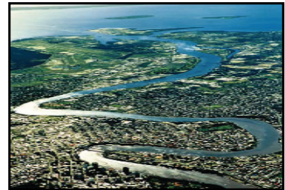
Northshore Hamilton Development Urban Land Development Authority

The East Perth Redevelopment Authority (EPRA) is responsible for the redevelopment and revitalisation of land from East Perth to Northbridge to attract greater residents, workers and visitors to these inner city areas. EPRA has commissioned a review of the 2004 Riverside Masterplan, with the objective of creating a diverse mixed use precinct, encompassing 40 hectares of land at the East Perth gateway to the city. Pracsys has carried out a comparative socio-economic analysis of changes to the Riverside Masterplan to determine whether retail and residential yield and density are appropriate and to ensure the precinct achieves economic, social and environmental sustainability outcomes. Given the scale and mix of user groups and estimated expenditure from the Masterplan Review, the Riverside precinct can be expected to operate as an attractive, diverse precinct.